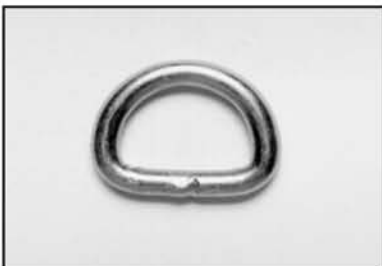
ITEM: 1" Short D-Ring BREAK STRENGTH (lbs.): 2500 W.L.L. (lbs.): 800