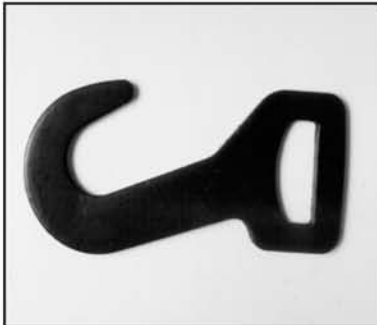
ITEM: 1" Flat J Hook BREAK STRENGTH (lbs.): 1100 W.L.L. (lbs.): 350