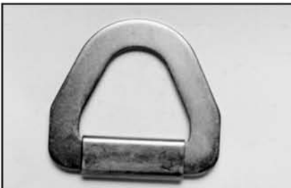
ITEM: 2" Delta Ring BREAK STRENGTH (lbs.): 10000 W.L.L. (lbs.): 3300