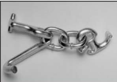
ITEM: Cluster Hook BREAK STRENGTH (lbs.): N/A W.L.L. (lbs.): N/A