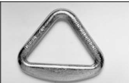
ITEM: 4" V Ring BREAK STRENGTH (lbs.): 20000 W.L.L. (lbs.): 6000