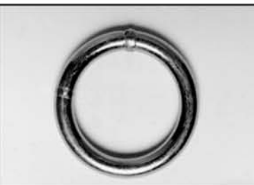
ITEM: 2" x 3/8" Round Ring BREAK STRENGTH (lbs.): N/A W.L.L. (lbs.): N/A