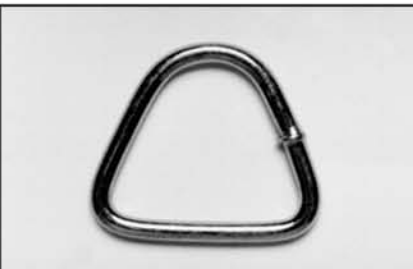
ITEM: 2" Round D-Ring BREAK STRENGTH (lbs.): 5000 W.L.L. (lbs.): 1600