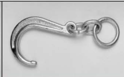
ITEM: 8" J Hook (15" available) BREAK STRENGTH (lbs.): N/A W.L.L. (lbs.): N/A