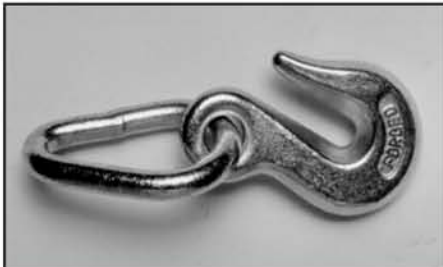
ITEM: Grab Hook BREAK STRENGTH (lbs.): 16200 W.L.L. (lbs.): 5400