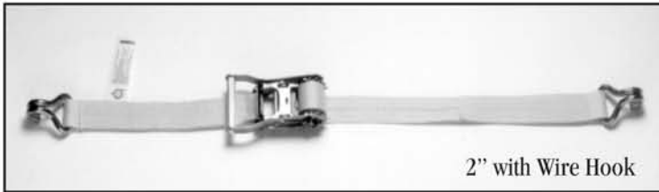
2" with Wire Hook

Pictured below are our most common tiedown assemblies. Any combination of hardware can be manufactured to your specifications. 1" and 3" tiedown assemblies available upon request.