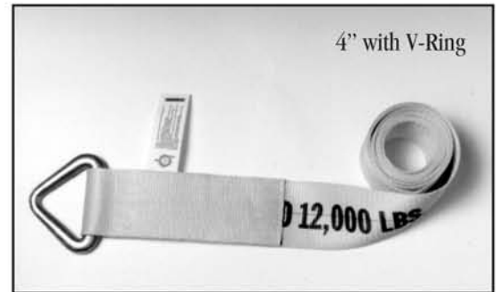
4" with V-Ring