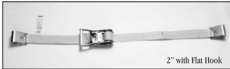
2" with Flat Hook