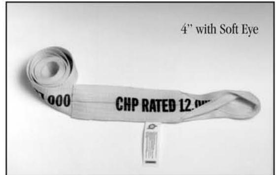
4" with Soft Eye